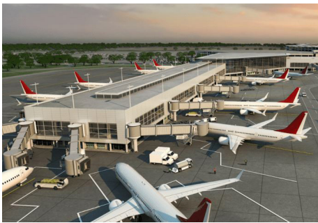
Nashville International Airport BNA