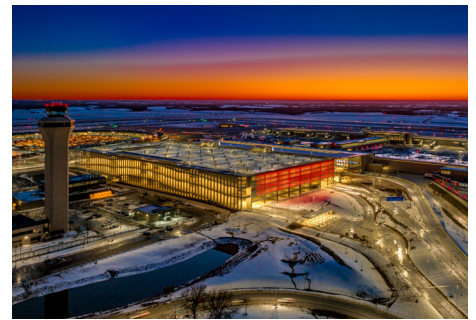
Kansas City International Airport MCI