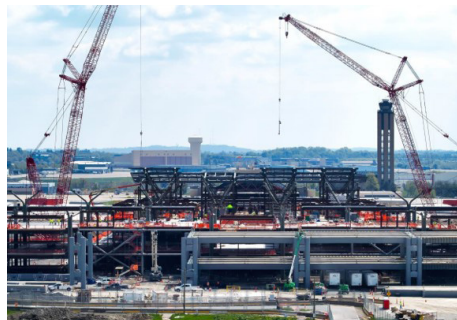
Pittsburgh International Airport PIT